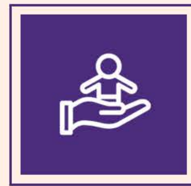
Day Care Services